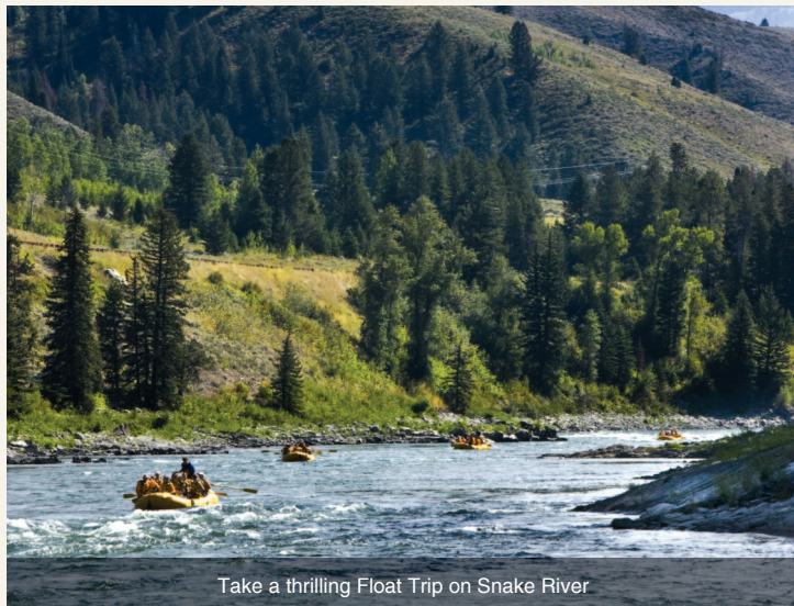
Take a thrilling Float Trip on Snake River

After breakfast transfer to the Salt Lake City International Airport for flights home anytime today. Meal: B