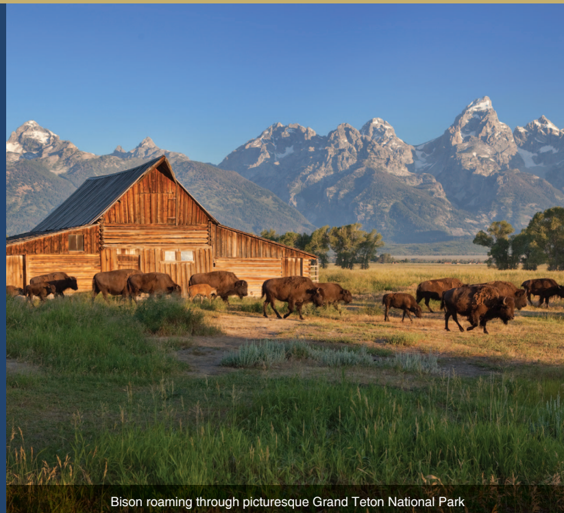
Bison roaming through picturesque Grand Teton National Park