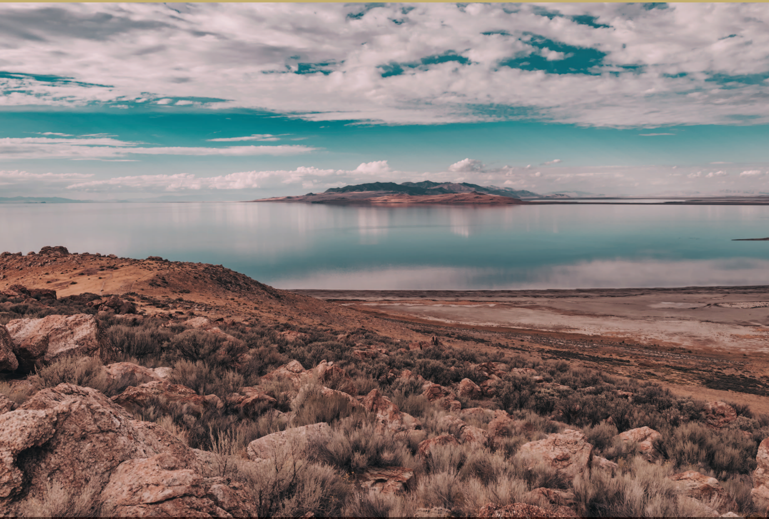
Great Salt Lake, Utah