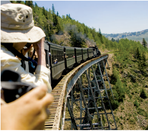
Cumbres & Toltec Scenic Railroad